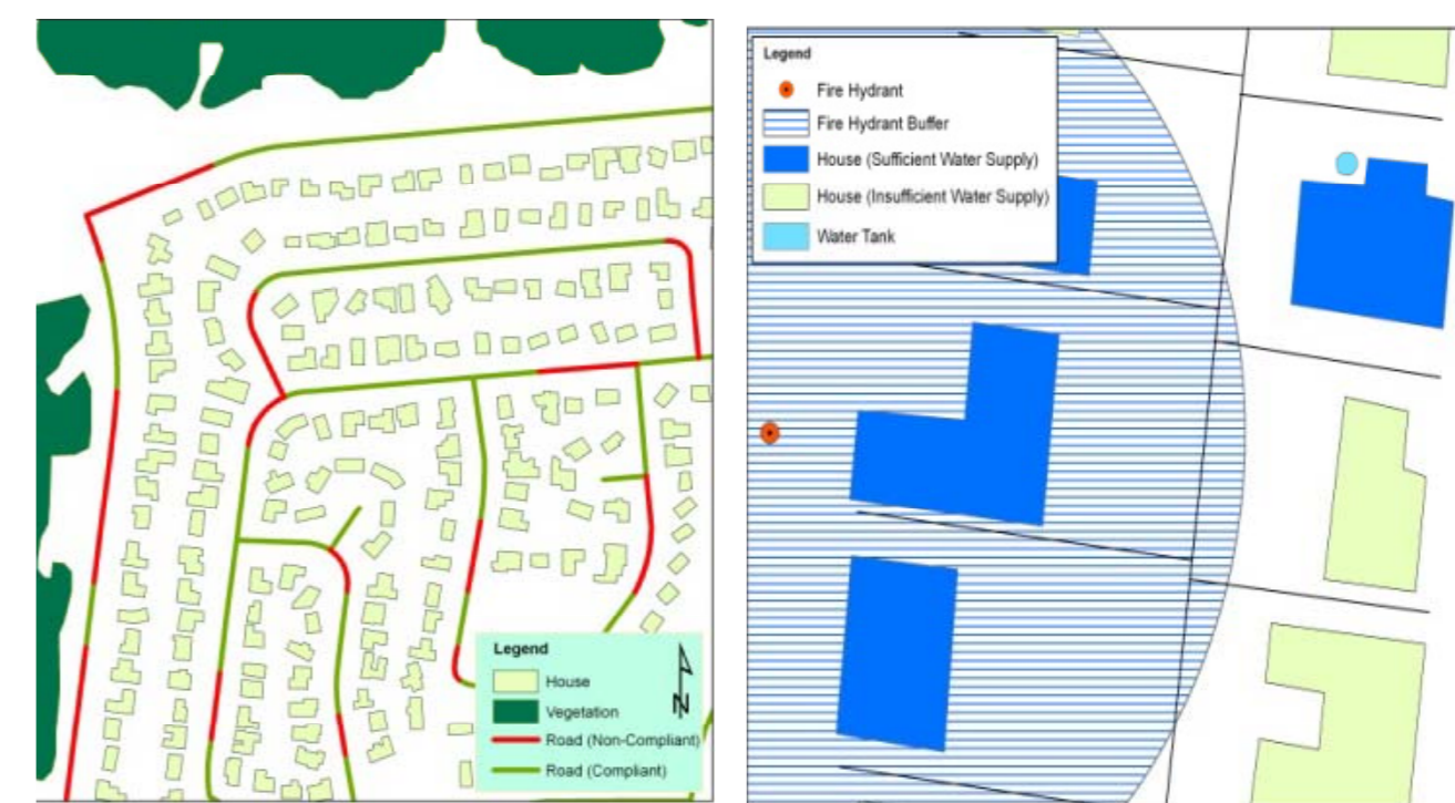
Figure 1: GIS analysis of urban interface compliance with BPM's

Where these measures are implemented it is likely that they will result in an increase in the likelihood of house survival when compared to an urban interface area which is non-compliant. Due to the scale at which these measures are implemented, only a risk assessment method which is capable of including the entire urban interface zone can be used to assess the full benefit of implementing BPM's.