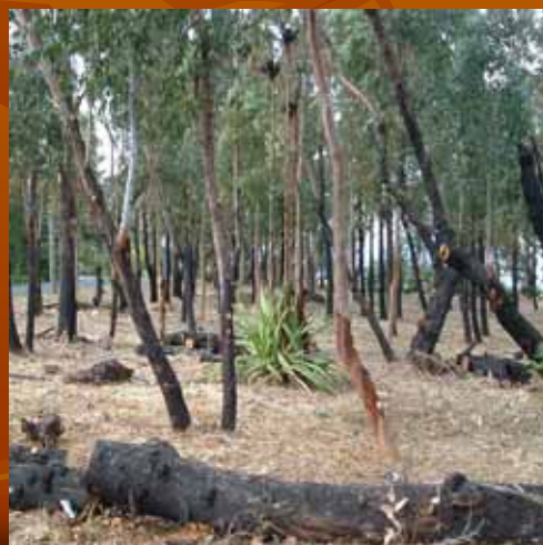
Stanwell Tops – APZ established