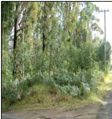
Stanwell Tops – Before APZ (area burnt 2 years prior in Christmas Fires)