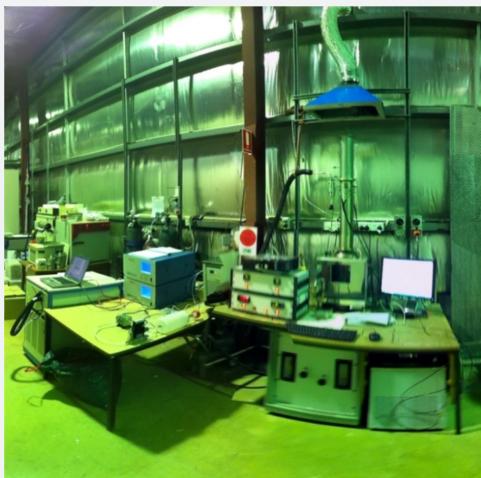
Figure 1: Mass loss calorimeter, PTR-MS and CO 2 and CO analysers

Leaves from Eucalyptus saligna , E. bicostata and E. tereticornis were cut from trees, weighed and either analysed immediately, air dried at 23°C for 24 hours, oven dried at 40°C for 24 hours or oven dried at 75°C for 24 hours before analysis. These materials were then combusted in a mass loss calorimeter (Fig. 1) at a heating intensity of 25 kW m -2 . Measurements of the CO 2 and CO emitted were made using infra-red gas analysers. VOCs were quantified using proton transfer reaction-mass spectrometer (PTR-MS) and identified using gas chromatography-mass spectrometry (GC-MS).