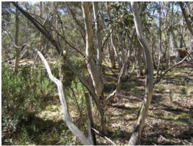
Figure 1. Changes in elevated fuels due to management practice

Sturtevant et al (2004) found in studies across the United States that growing density of understorey vegetation due to management practices increased the incidence of crown fire in some forest types, whereas it decreased crown fire incidence in others. In the first case, the understorey was dominated by fir species, whereas in the second case it was dominated by less flammable deciduous species. The flammability of plants varies with both leaf flammability and plant architecture, but the relationship needs to be better understood to avoid land management practices that could increase bushfire threat.