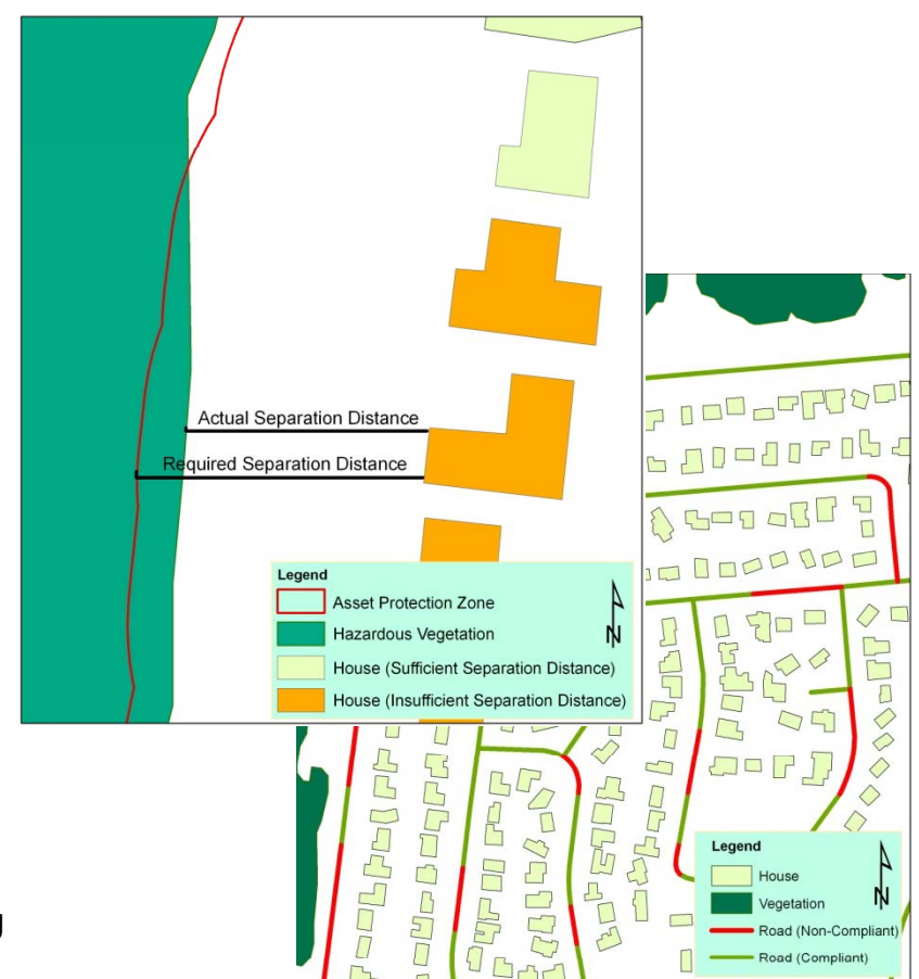
Figure 1: Output from BPM Tool (APZ and Access Compliance)

While the BPM Tool can be used to determine changes which are required to achieve compliance with BPM's, risk assessment is required to quantify the benefit of implementing change.