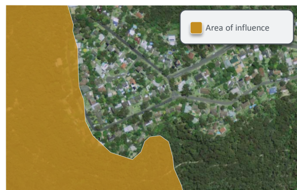
Figure 1. Area of high potential influence on bushfire risk at the WUI as a function of weather, terrain and vegetation/fuel.

We are using a statistical modelling approach and quantitative GIS to integrate house loss data from a succession of major fires (1990s onward) in order to quantify risk of house loss at a landscape scale. We are quantifying the likelihood of damage/destruction in relation to WUI condition (such as degree of clearing, fuel age, and vegetation type) with other factors such as weather and terrain as covariates.