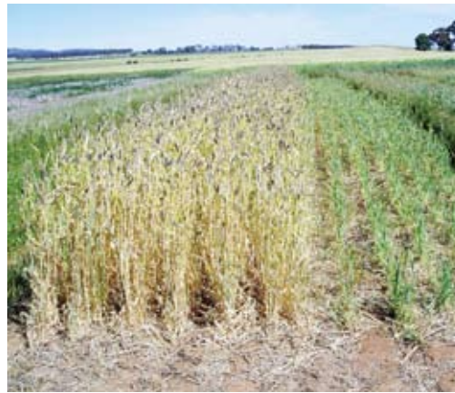
◀ Figure 3: Senescence progressing in a field of barley (unmown on left and mown on right) in a demonstration plot at Black Springs, South Australia, October 2008.

growth and die-off has been found between grass species.