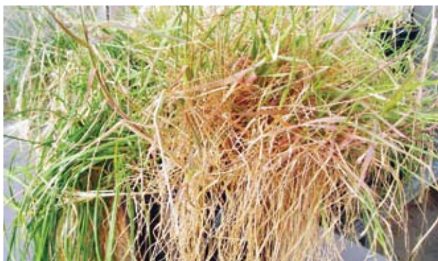
◀ Figure 1: Senescence progressing in an annual ryegrass plant in the glasshouse.

The potential exists to predict grassland curing levels using agricultural plant growth models. This relies on adapting these models by developing reliable